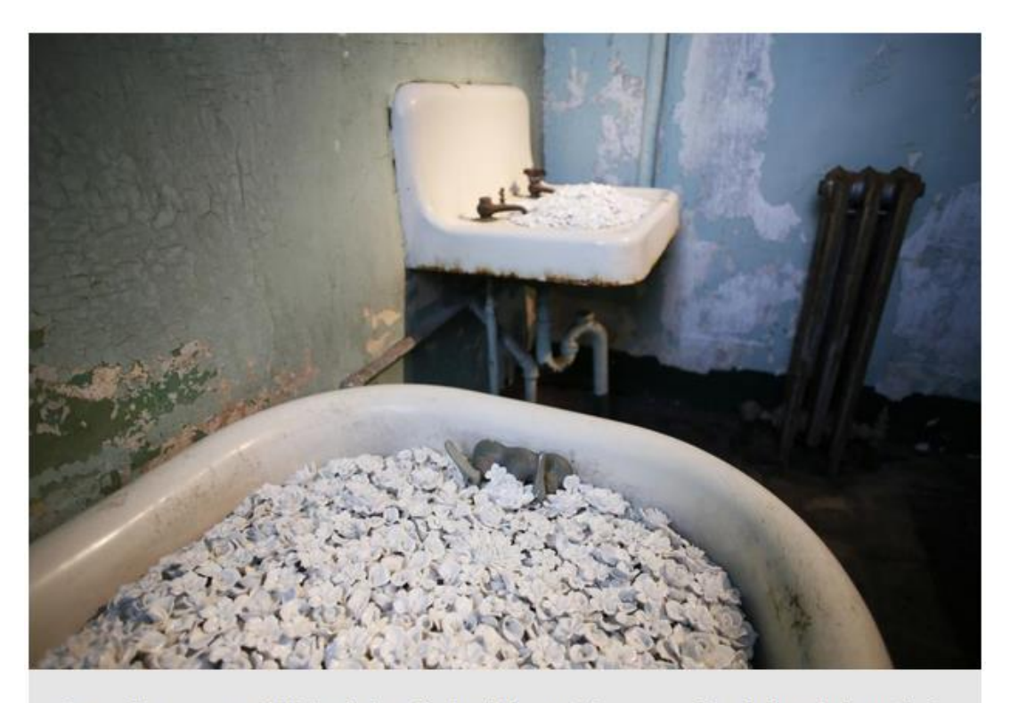
September 24, 2014Ai Weiwei's installation "Blossom" is presented in the hospital ward of Golden Gate National Recreation Area's Alcatraz Island near San Francisco, California, September 24, 2014.

@Large's seven site-specific installations cover several spaces in Alcatraz—a former military and later maximum security prison that has since become a popular tourist site—including some rooms that are not normally open to the public.