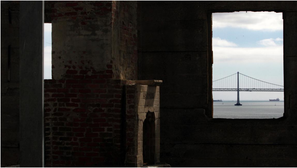
'@Large: Ai Weiwei on Alcatraz'. The outside world is framed in a window in the remains of a warden's house on Alcatraz Island in San Francisco Bay.