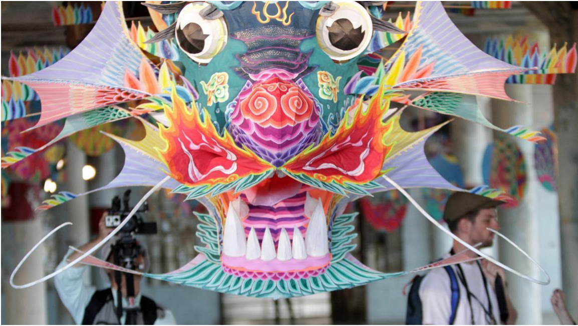
'@Large: Ai Weiwei on Alcatraz'

"With Wind" is a contemporary version of the traditional Chinese dragon kite, with human rights quotes written on some of its parts. It's one of the seven art installations by Chinese dissident Ai Weiwei on Alcatraz Island in San Francisco Bay.