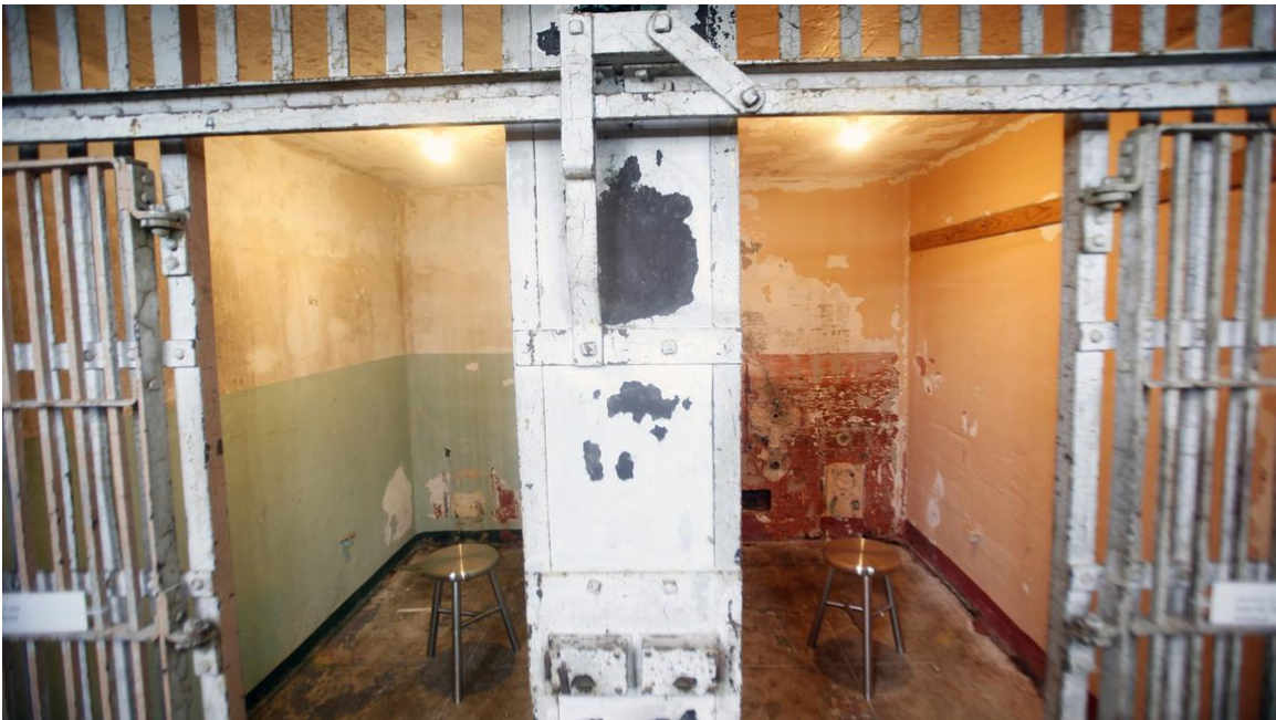
'@Large: Ai Weiwei on Alcatraz'

"With Wind" is a contemporary version of the traditional Chinese dragon kite, with human rights quotes written on some of its parts. It's one of the seven art installations by Chinese dissident Ai Weiwei on Alcatraz Island in San Francisco Bay.