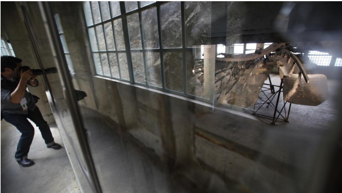
'@Large: Ai Weiwei on Alcatraz'