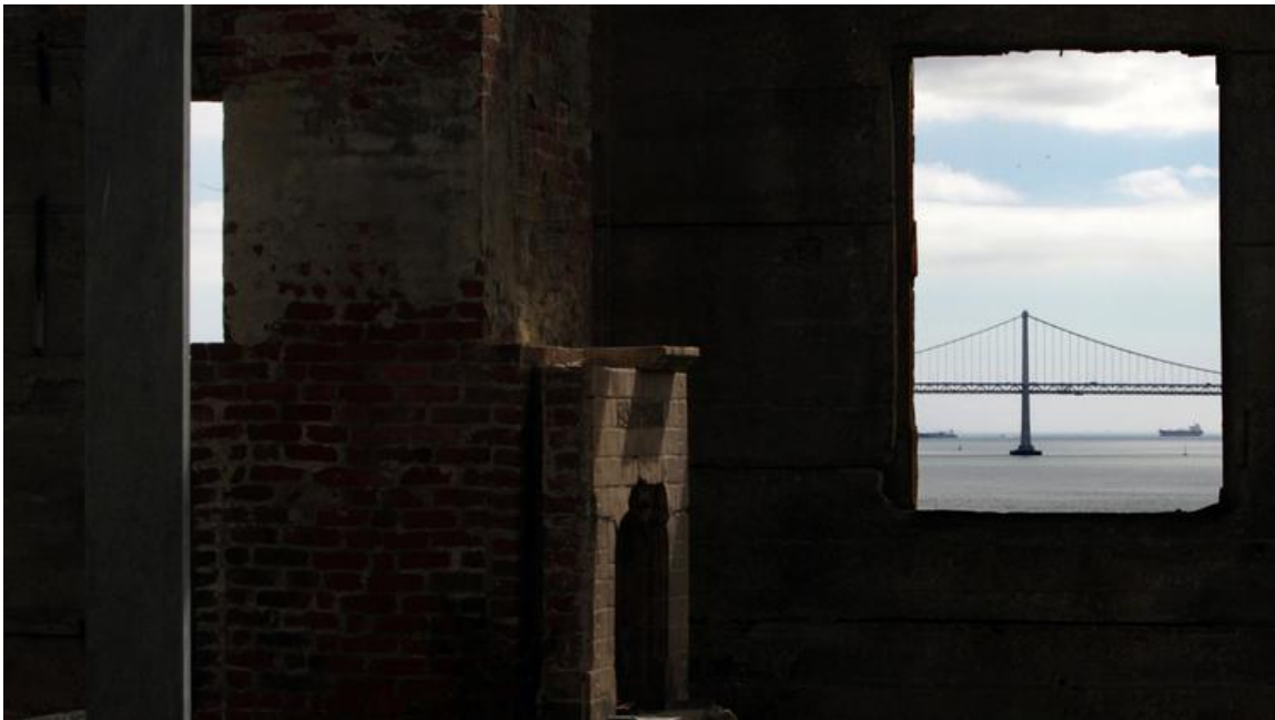
The outside world is framed in a window in the remains of a warden's house on Alcatraz Island in San Francisco Bay.