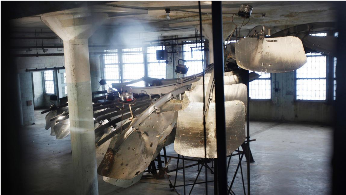
'@Large: Ai Weiwei on Alcatraz'

The mammoth 5-ton metal installation "Refraction" -- part of Ai Weiwei's exhibition at Alcatraz -- is imprisoned within the stifling gloominess of the former prison. It's a reflection of a way of life made impossible.