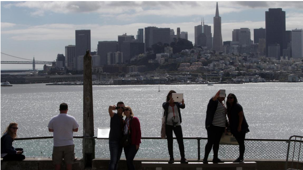
'@Large: Ai Weiwei on Alcatraz'

The mammoth 5-ton metal installation "Refraction" -- part of Ai Weiwei's exhibition at Alcatraz -- is imprisoned within the stifling gloominess of the former prison. It's a reflection of a way of life made impossible.