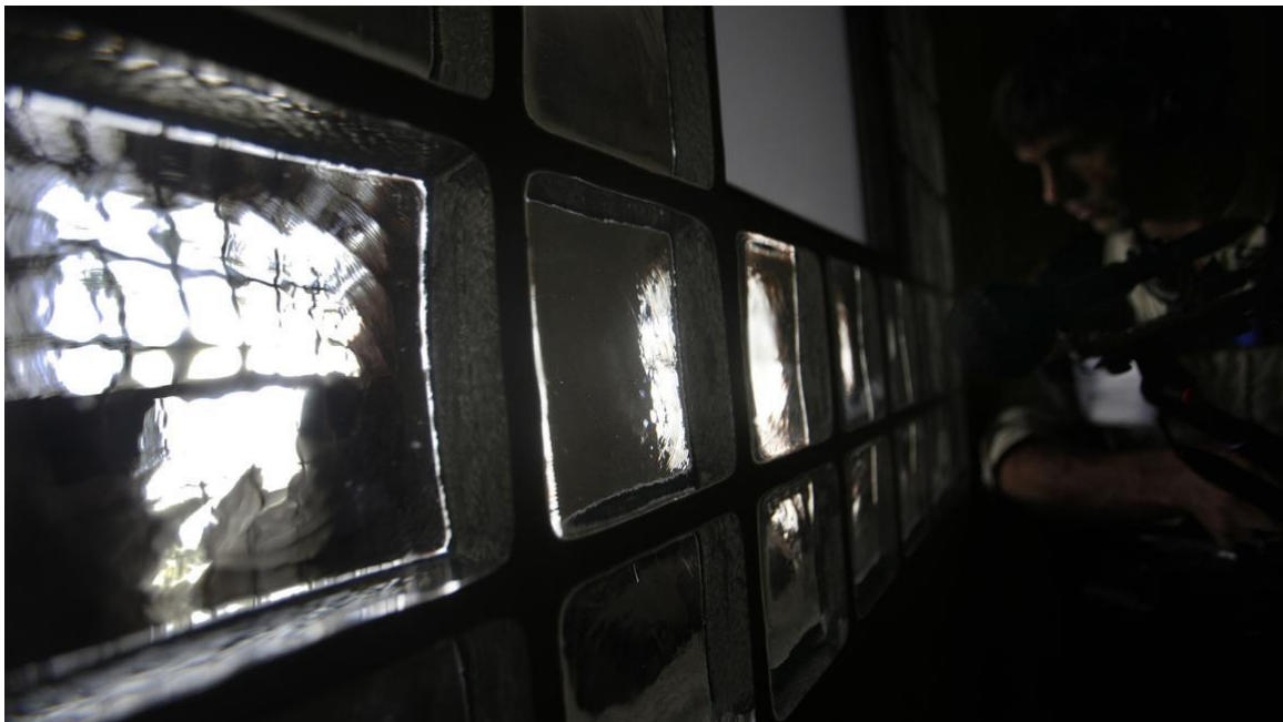
'@Large: Ai Weiwei on Alcatraz'

Journalist Katy Steinmetz photographs "Blossom," made up of intricately detailed ceramic flowers set into utilitarian fixtures in several hospital ward cells and medical offices. It's one of seven art installations by Chinese dissident Ai Weiwei on Alcatraz Island in San Francisco Bay.