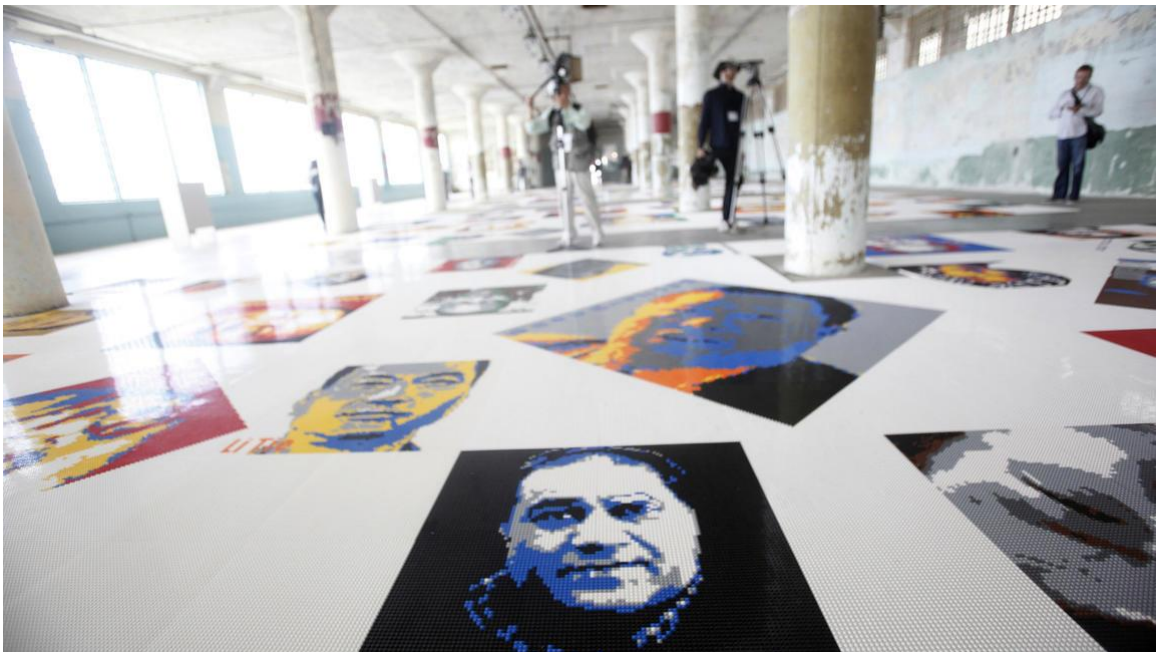
'@Large: Ai Weiwei on Alcatraz' The image of Uyghur economist Ilham Tohti, foreground, is among the Lego portraits of imprisoned or exiled individuals in "Trace," one of seven art installations by Chinese dissident Ai Weiwei, on Alcatraz Island in San Francisco Bay.