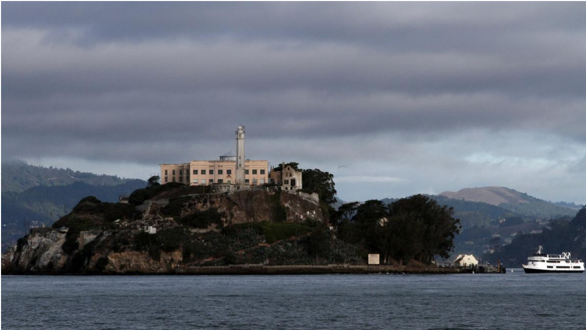
'@Large: Ai Weiwei on Alcatraz' Alcatraz Island in San Francisco Bay is the site of Chinese dissident artist Ai Weiwei's new exhibition.