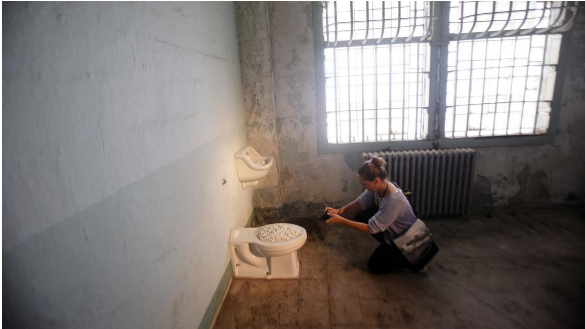
'@Large: Ai Weiwei on Alcatraz'

Journalist Katy Steinmetz photographs "Blossom," made up of intricately detailed ceramic flowers set into utilitarian fixtures in several hospital ward cells and medical offices. It's one of seven art installations by Chinese dissident Ai Weiwei on Alcatraz Island in San Francisco Bay.