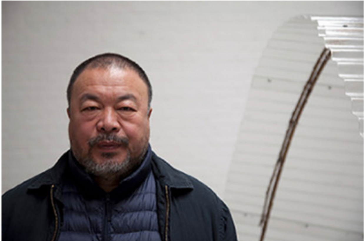
Ai Weiwei in his Beijing studio

About 1.4 million people visit Alcatraz every year—filling the boats to 95 percent capacity, but the exhibit will run from late September until late April, and Rasmussen says the crowds thin out considerably during the cold, rainy weeks of early winter.