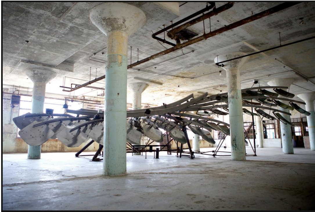
"Refraction," a winglike sculpture made up of teapots and metal panels from Tibetan solar cookers.