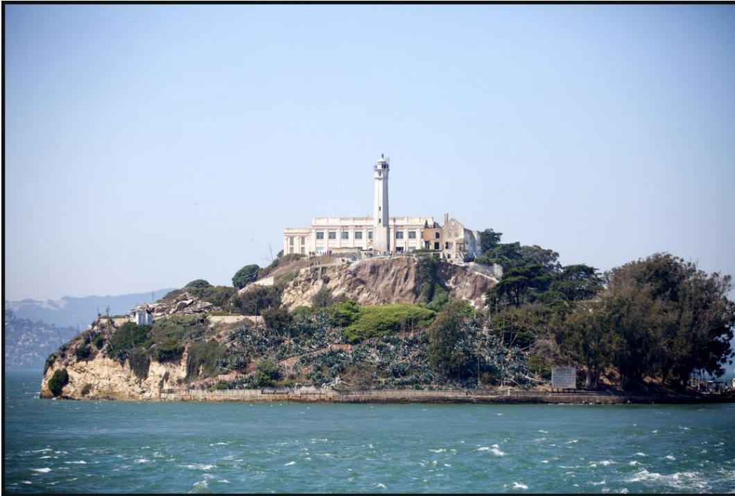
Alcatraz Island in San Francisco Bay, which will be the site of the exhibition “@Large: Ai Weiwei on Alcatraz,” which runs through April 26.