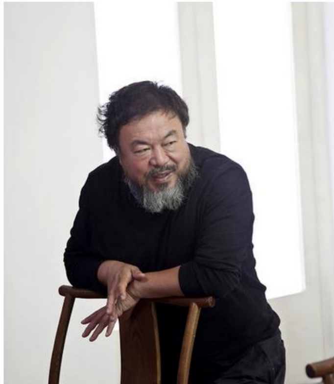
Ai Weiwei in his Beijing studio.

Given Mr. Ai's sharp critiques of the Chinese government and the tireless campaigning for freedom of expression that led to his own imprisonment in 2011, he could have included himself in the group portrait. He did not. But his 81-day detainment, a numbing and mostly solitary confinement, fueled some of the exhibition's themes, and the seizure of his passport at that time — it was never returned — has shaped the making of this show.