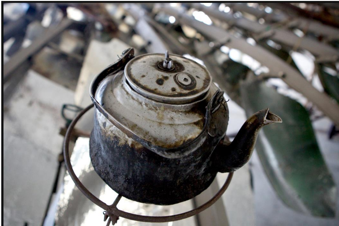
A teapot detail in "Refraction."