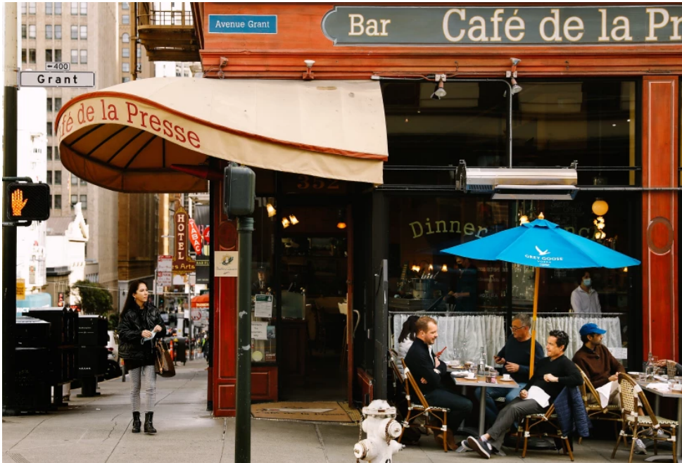
Customers dine at Cafe de la Presse earlier this month.

(The Chinatown gate is across the street.) But for months, Café de la Presse cut back its schedule and was serving only lunch and dinner. Now — as of Jan. 18 — breakfast is back , offered Tuesday through Sunday, 8 a.m.-11 a.m. There's also brunch on Saturdays and Sundays, 11 a.m.-4 p.m. Or consider the alternative I adopted while Cafe de la Presse was unavailable: the unfussy Roxanne Café on Powell, which has indoor and outdoor tables and does breakfast all day. Also, you'll see cable cars rumbling past outside.