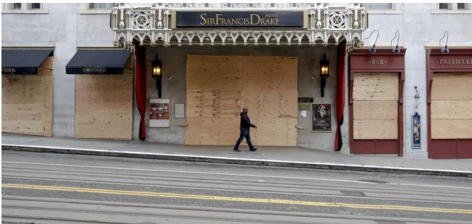
The boarded entrance to the Sir Francis Drake Hotel in 2020.