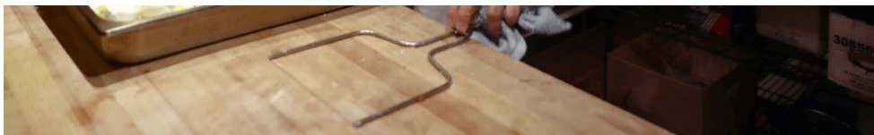
Kitchen activity at Chez Panisse in 2019.