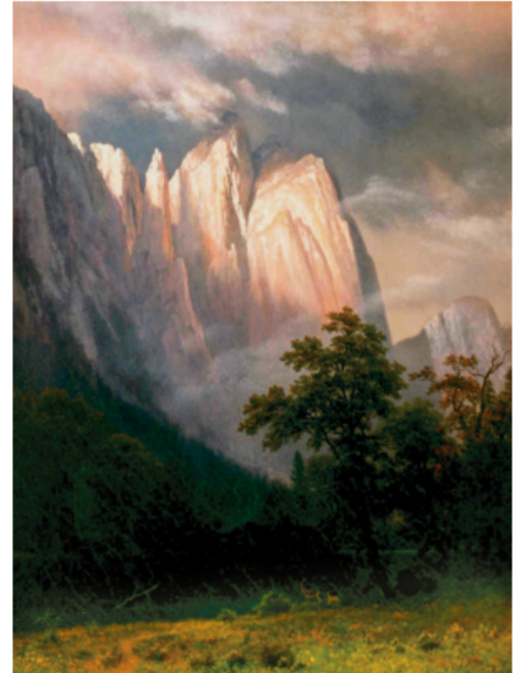
Albert Bierstadt's 1870 oil painting "Cathedral Rocks, Yosemite"