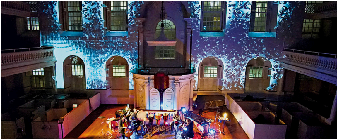
Masary Studios, a trio of Boston artists, created the installation, "Harsh is Truth," at the Old South Meeting House, a site along the Freedom Trail in Boston National Historical Park.

The voice of Frederick Douglass rang through a cavernous, nearly 300-year-old meeting house in Boston last year. "If there is no struggle," he said in a recording of an 1857 speech, "there is no progress." As the famous abolitionist, orator and social reformer spoke, his words were projected on a two-story wall, and musicians played the marimba and mbira, an African thumb piano.