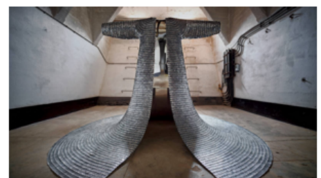
Artist Do Ho Suh used stainless steel military dog tags to construct “Some/One.” The piece was part of “Home Land Security,” a 2016 exhibit of contemporary works by 18 artists and collectives from around the world.

Visitors learn how some Americans spoke against the incarceration, but most were silent. Stations throughout the